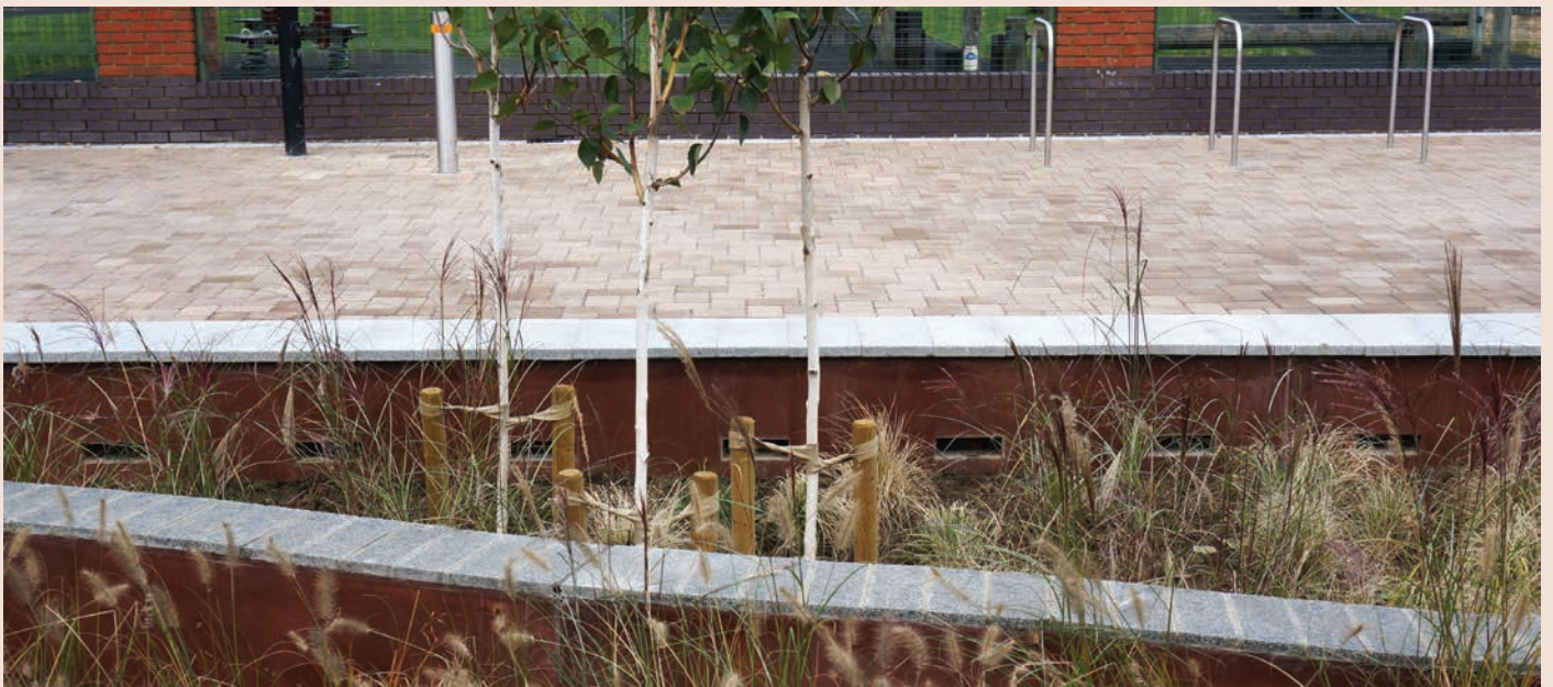
Water from the permeable paving simply discharges horizontally into the planted basins through slots in the side-walls.

The original road surface has been replaced with attractive, 'self-draining' concrete block permeable paving. Clean water from the permeable paving passes into the planted basins. The 'wiggly wall' feature meanders through both paving and planting.