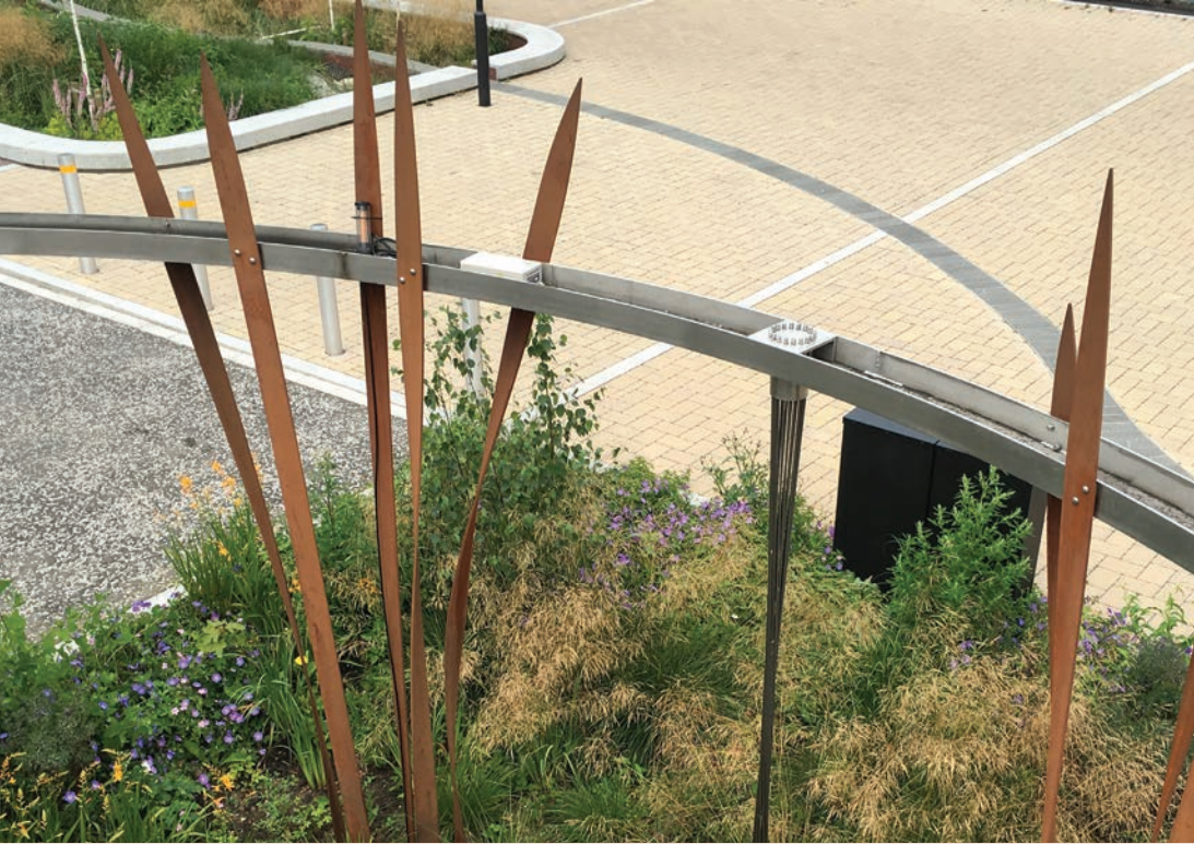
Sculptural metal elements at high level feed roof-water into raingardens.